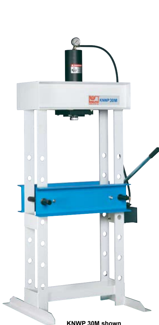
KNWP 30M shown