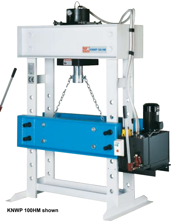
KNWP 100HM shown