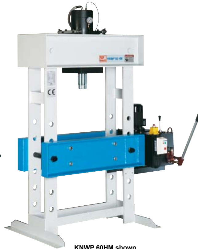
KNWP 60HM shown