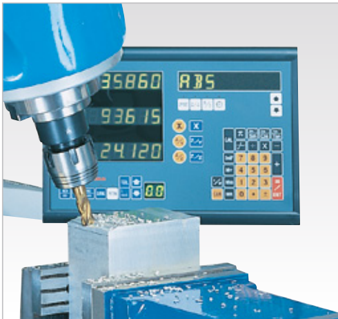
Cutter head swivels \pm 360^\circ