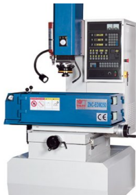
ZNC 250 is shown