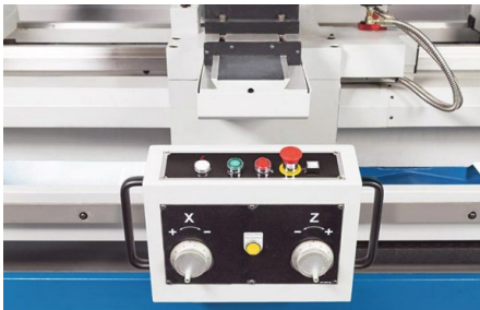
Compact control unit with electronic hand-wheels