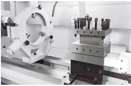
Automatic changing 4-fold steel holder