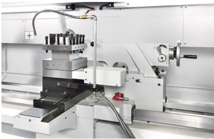
Easy handling: for positioning, the tailstock can be coupled to the support