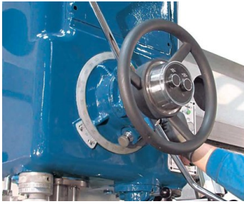
Depth stop with vernier scale