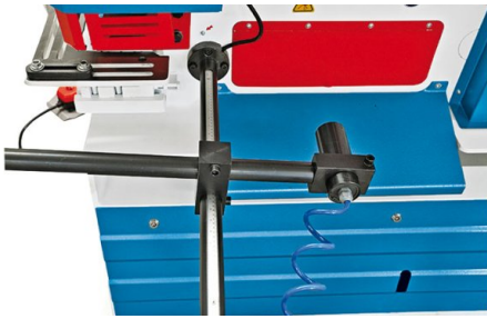
Back gauge with automatic cut activation

• Models HPS 45H and HPS 60 H feature a powerful hydraulic cylinder • Models HPS 65 H, HPS 85 H, HPS 115 H and HPS 175 feature 2 hydraulic cylinders allowing simultaneous operation at 2 stations