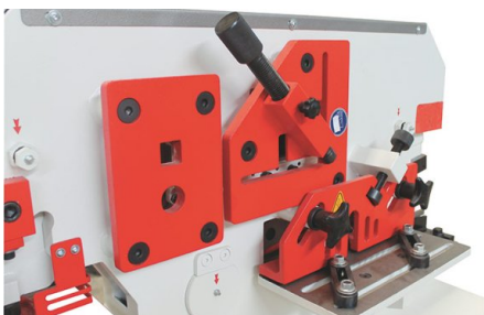
Compact design and excellent rigidity