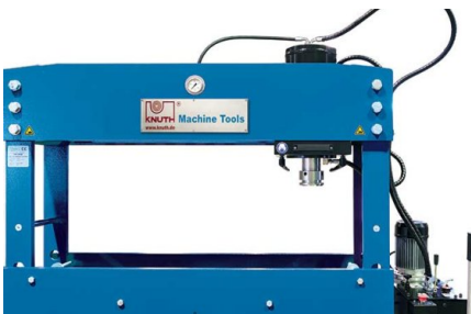
The hydraulic cylinder can be moved laterally and is clamped mechanically