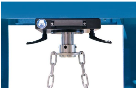
Table height can be adjusted easily via hydraulic lifting gear