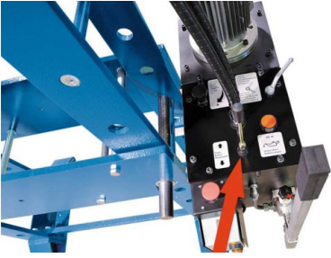
The press is operated via joystick