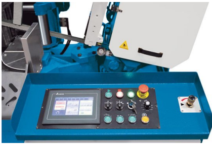
The touchscreen allows for easy and convenient programming for fully automated operation