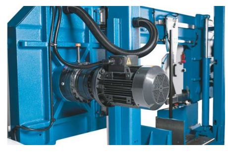
Powerful main drive motor, infinitely variable