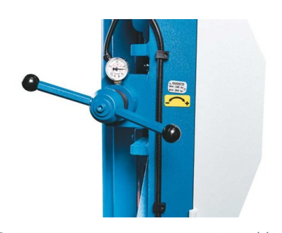
Pressure gauge ensures correct saw blade tension for increased blade life and cost reduction