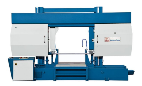
HB1020 L - easy material handling through input / output rollers