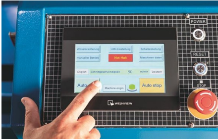
In Auto Mode, feed distance, cut angle, and number of cuts can be programmed within the respective configurations