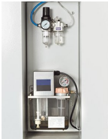
Central lubrication device and maintenance unit