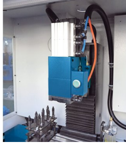
Pneumatic tool clamping