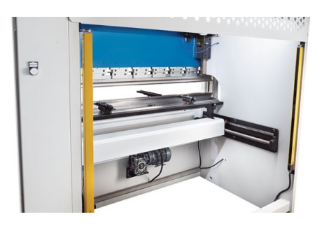
The rear side is protected by light curtains

Intuitive controller with large touchscreen and three operating modes: manual/semiauto/automatic