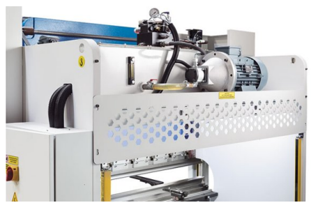
Hydraulic unit positioned on the top of the machine for extra bending space.