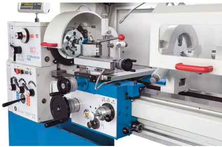
Central lubrication is integrated into the support for easy maintenance and handling