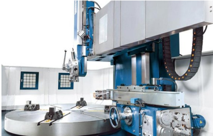
Vertical support includes a 5-station tool holder, side support with independent feed for inside and outside turning