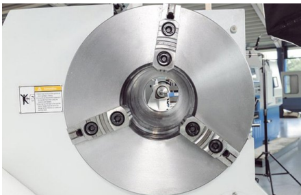
Spindle bores up to 9 inch