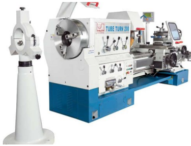
The rear-mounted lathe chuck ensures increased stability for long workpieces