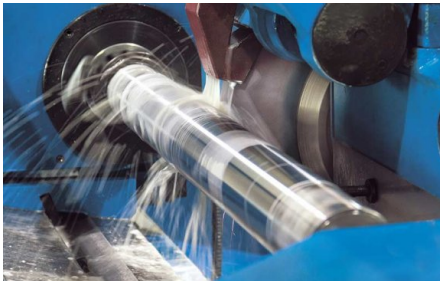
Wet grinding with rotating part