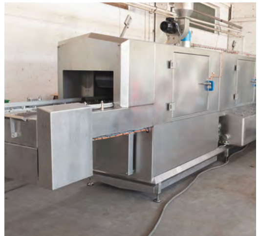
Continuous container washing system