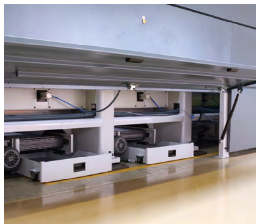
Hardware and slag conveyor