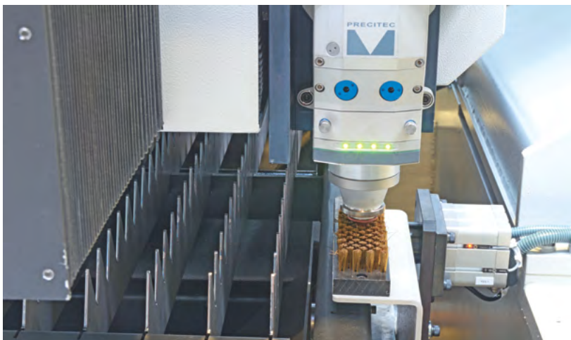
Precitec ProCutter Autofocus Cutter Head: • Automatic height sensing calibration after nozzle replacement • automatic nozzle cleaning