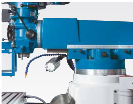
Variable throat widths and machining angles