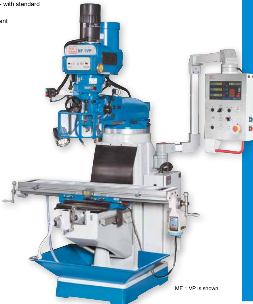
MF 1 VP is shown